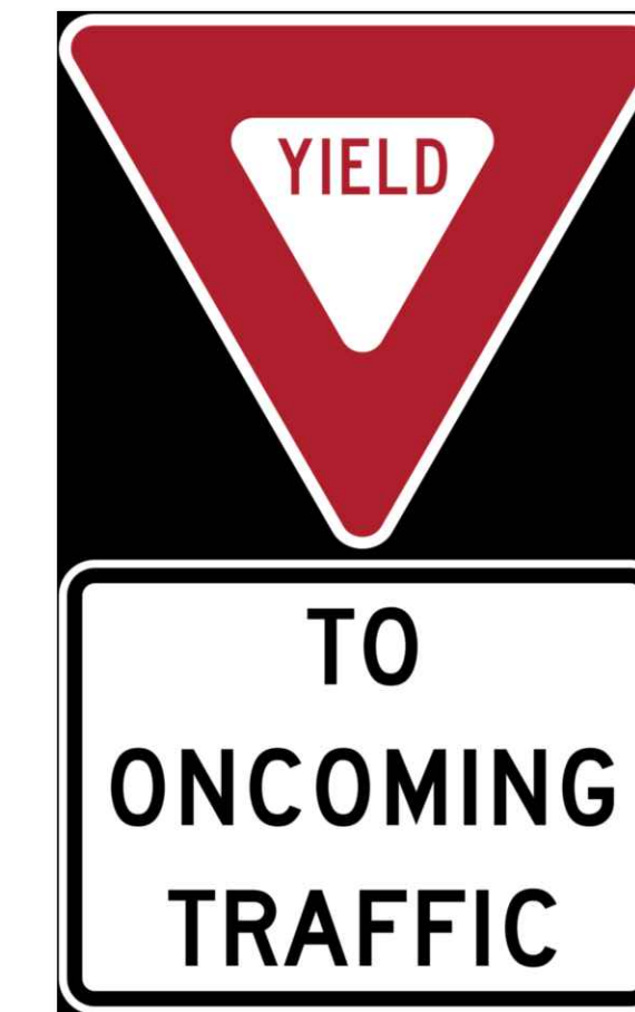
R 1-2 (36" x 36") & R 1-2AP (18" x 24") SIGN DETAIL

NOTE: ROAD CLOSURE SIGNAGE SHALL BE PLACED IN ACCORDANCE WITH PENNDOT PUBLICATION 213