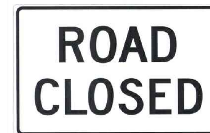
R11-2 SIGN (30" x 48") DETAIL